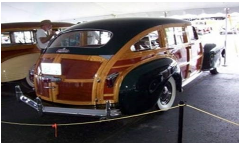
1942 Chrysler Town and Country